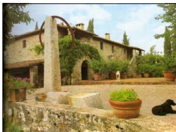
Montevervine's well kept property