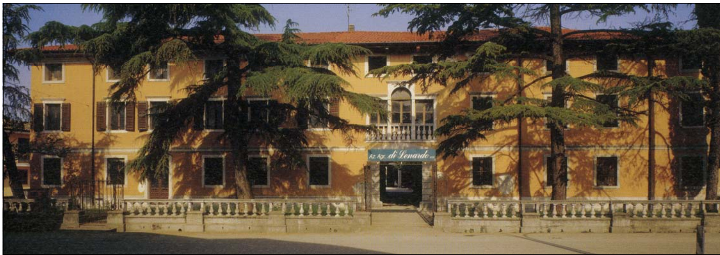
Di Lenardo's property