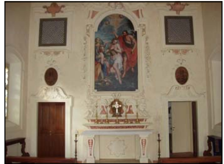
La Cappuccina’s chapel