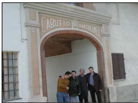
Tenuta La Volta winery entrance

Piedmont 2000 vintage. 100 point rating. The first ever perfect score for any vintage in any country.